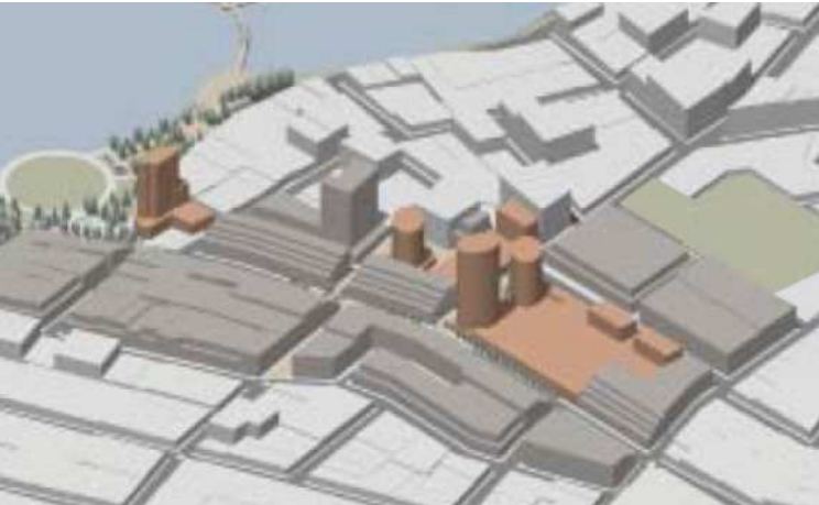
Masterplan virtual model of The Entrance Town Centre showing Lakeside in the foreground

Ben then referred to The Entrance Masterplan as exhibited by council that showed the relationship the Lakeside development had with other proposed development in The Entrance.