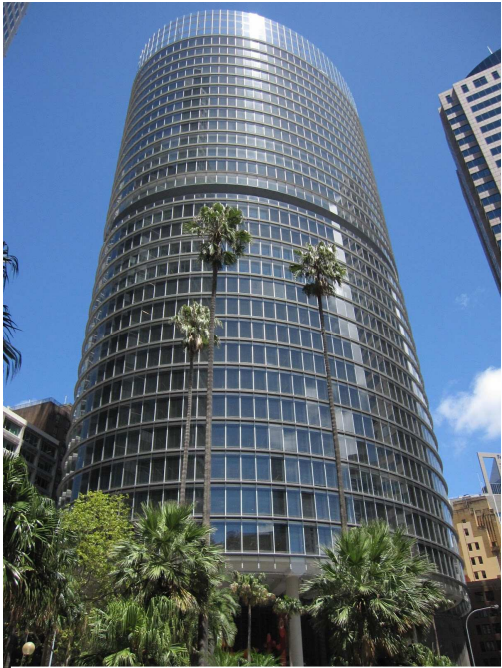
No 1 Bligh Street Sydney

What the architects have done is that they haven't just looked at what's around The Entrance, and have research widely for best practice design around Australia and overseas. Their work at No 1 Bligh 5 Sydney, has recently won a number of international awards and is an excellent example of the design quality Architectus is renowned for.