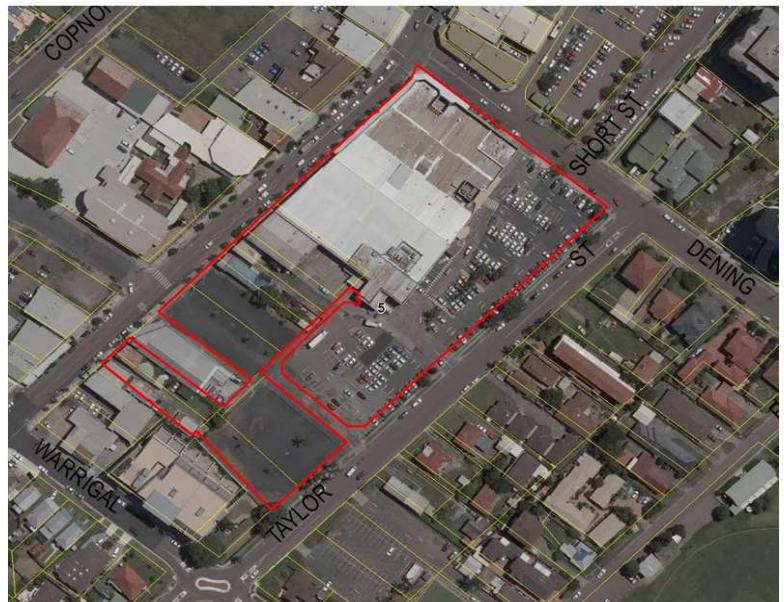
The Lakeside Development Site