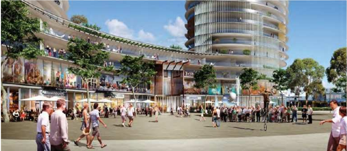
Artist's impression of Lakeside's large north facing piazza